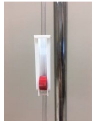
Roller clamp. SHA [Nutrition Services, Saskatoon] 2019.

8. Flush your infant/child's feeding tube with the recommended amount of room temperature water using the syringe. Your infant/child may require a larger amount of water for the flush depending on their fluid needs. Their dietitian will assist you in knowing how much formula and water to provide.