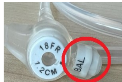
Balloon port. SHA [Nursing Practice and education] 2023.