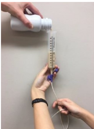
Gravity feeding bag on pole. SHA [Nutrition Services, Saskatoon] 2019.