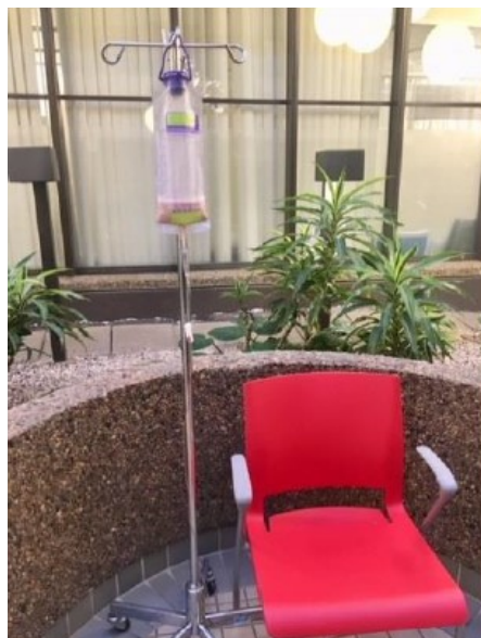
Gravity feeding bag on pole. SHA [Nutrition Services, Saskatoon] 2019.